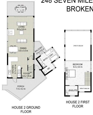
HOUSE 2 GROUND FLOOR