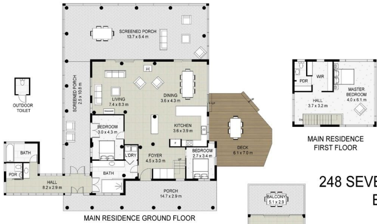
MAIN RESIDENCE GROUND FLOOR